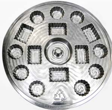
Hurco's Patented UltiMotion