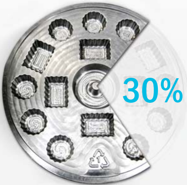
Conventional Motion Control

More margin per part? More machine capacity? The specific benefits will vary for each shop, but it's easy to see how UltiMotion will pay for itself faster than any other control technology available.