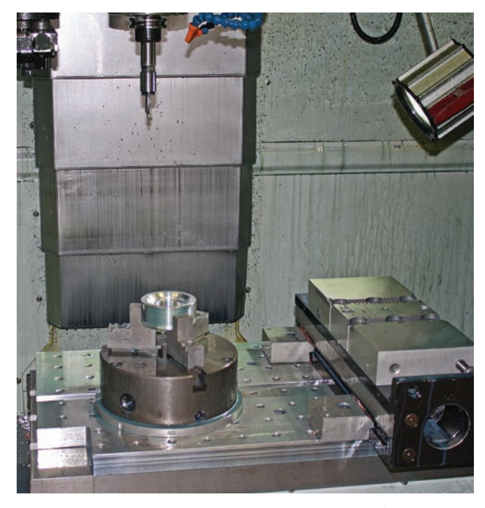
This accessory pulley is mounted in one of the VM10 mills to have its holes drilled and tapped.

ing with Hurco distributor Gage Machine Tool. They took the extra time to answer all of our questions and reassure us that they were there for us should we need any help down the road. They have followed through with those promises