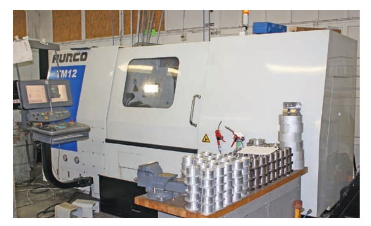
The TM12 was the company's first Hurco lathe purchase. The lathe is used to turn everything from large aluminum castings to small steel and aluminum bar.