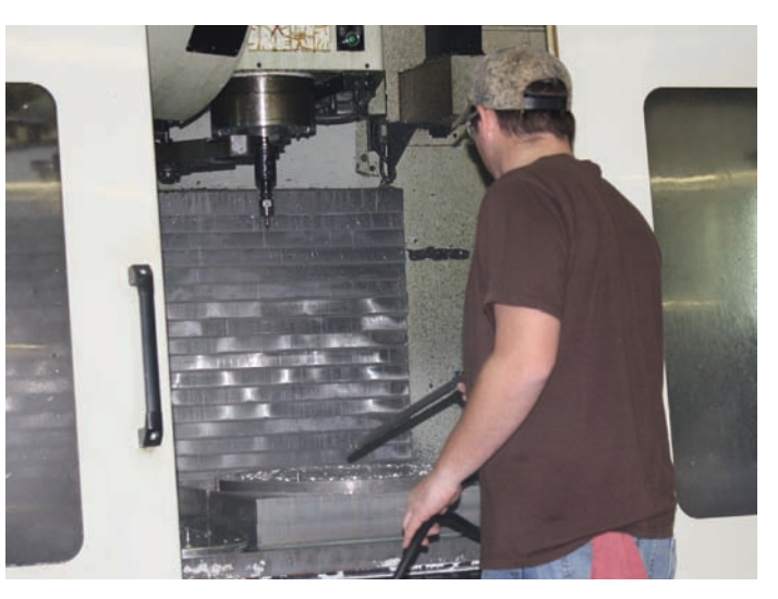
Waddle's operator is clearing a fixture of chips in preparation for another large flange.