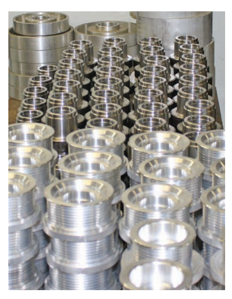
Shown are accessory drive pulleys and harmonic damper hubs. They have gone through the first operation and are ready for the second operation.

When the company's fleet of machines started to age, it had to find a replacement line of machinery that would provide the same or better quality of parts the shop was producing at a competitive price. "We interviewed several machine